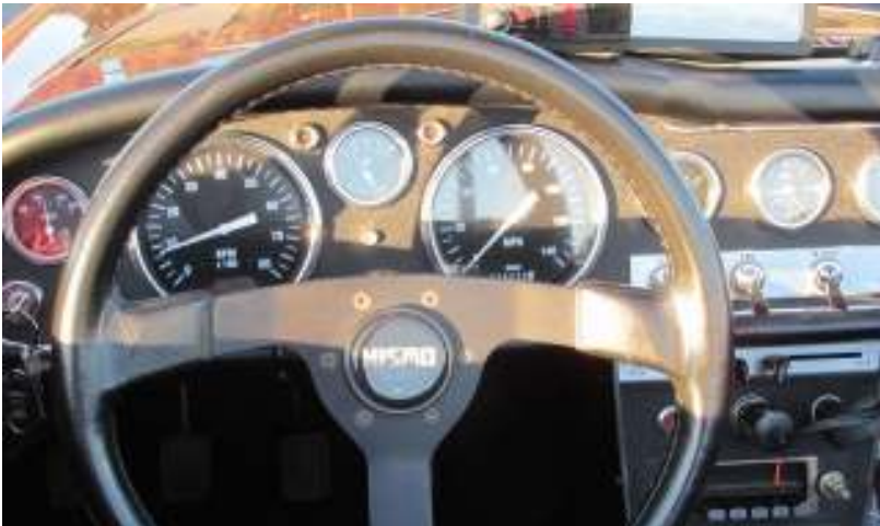
Classic 1967 dash