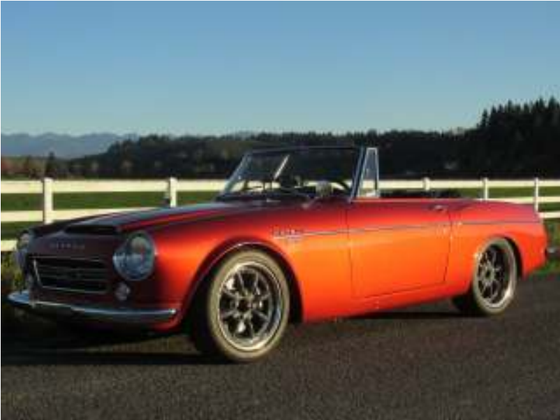
Paint color is Plymouth Prowler Flame Orange

I had the opportunity to purchase one of the best conversion roadsters so I had no choice but to buy it. Always looking to upgrade my collection.