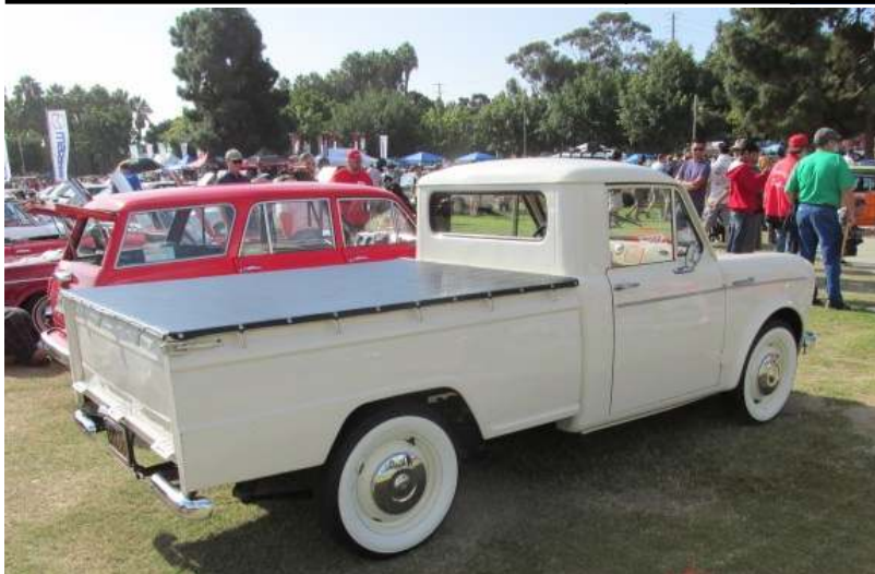
The wonderful 1960 Datsun 222 truck was there.