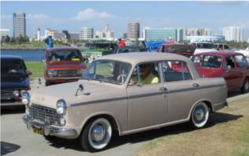
The NICE survivor tan 1962 Datsun 312 got First