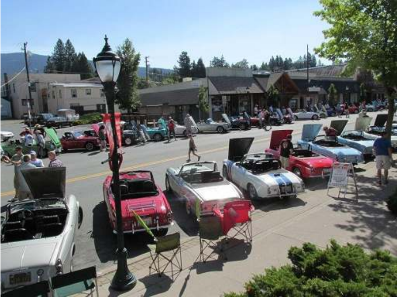
Mt Shasta Roadster Meet. 7-19-14. Fine Shasta Meet today. 74 roadsters! and 4 Z cars. HOT.