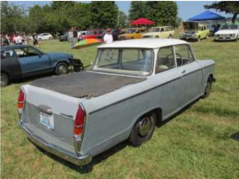
These rechromed hubcaps were perfect! including a Maxima photo for Gordon!