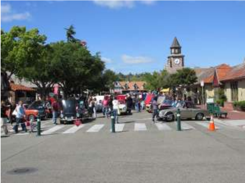
Main Street USA