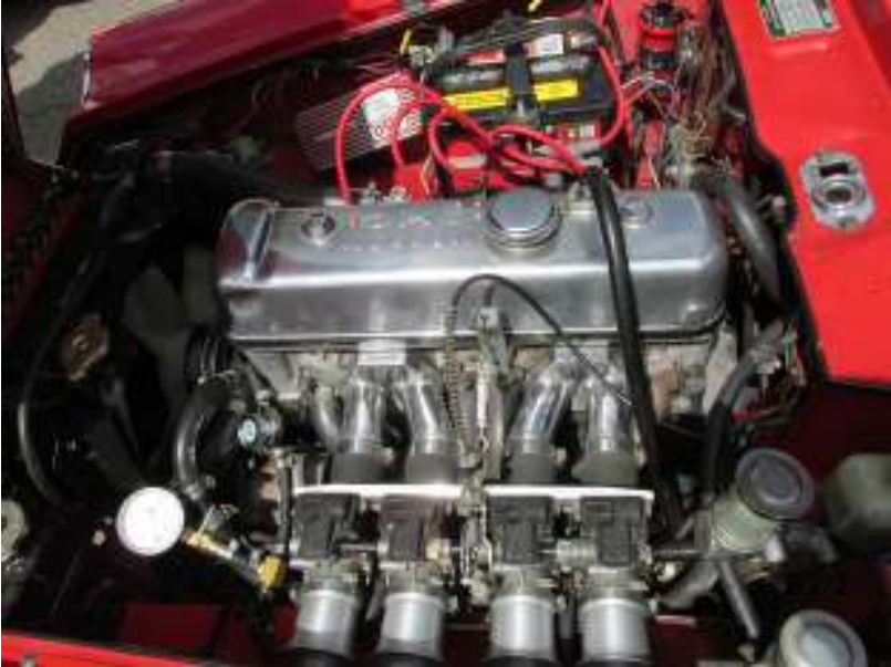
Motorcycle carburetors on a Datsun U20 roadster engine