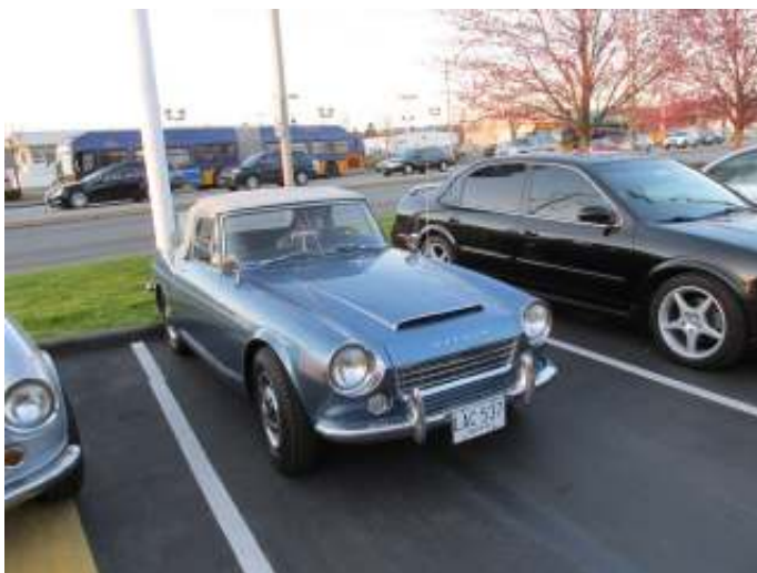
Low-windshield Datsun Roadster