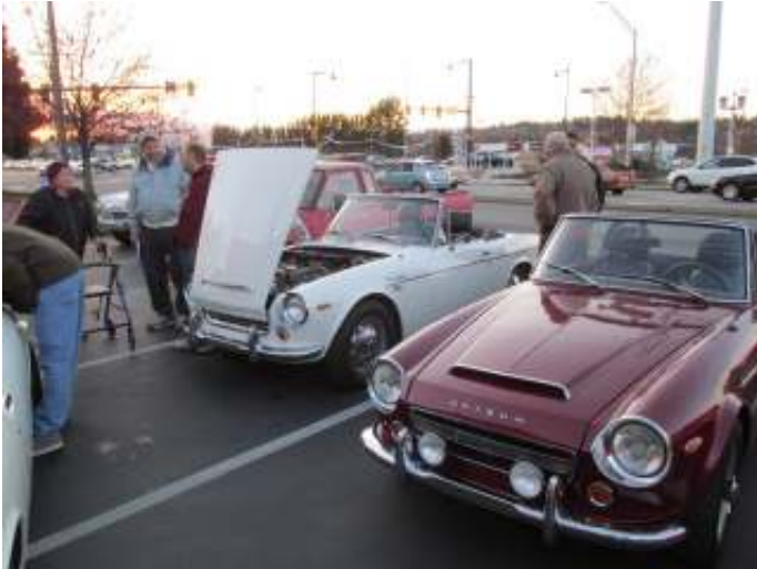
Discussing the Datsun 2000 Roadster (SRL311)