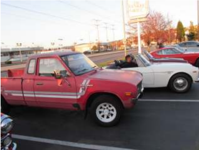
Jack's Datsun 620 King Cab work truck