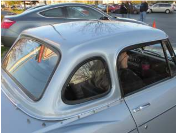
Rare hardtop for Datsun Roadster

Friday night, 21 March 2014 at the Yankee Grille in Renton.