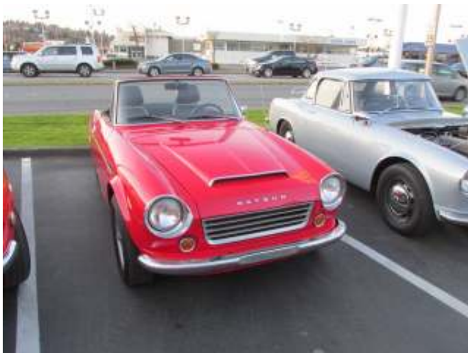
High-windshield Datsun Roadster