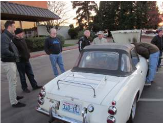
Datsun 2000 Roadster attracts a crowd