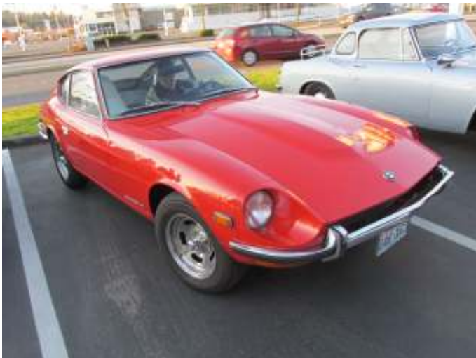
Roger's other 1972 Datsun 240Z