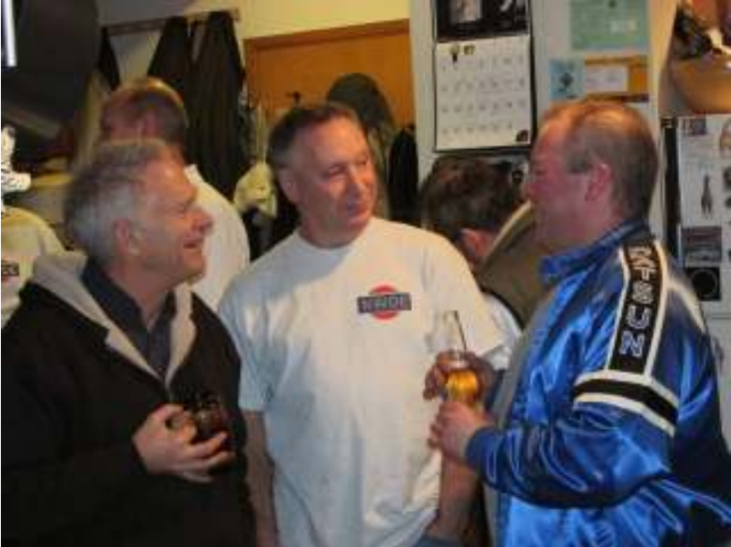
Plenty of talk and plenty of listening too