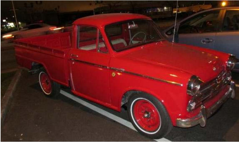
Rowland brought this NICE Datsun L320 truck