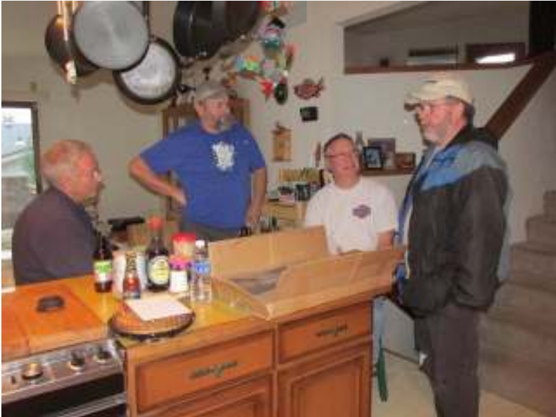
Shop talk and bench racing