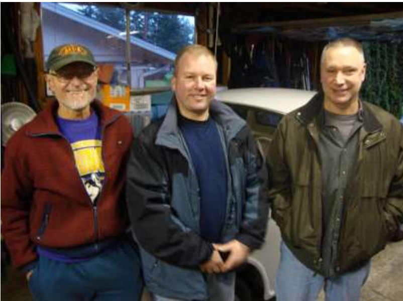
3 amigos covering up the white Datsun NL320