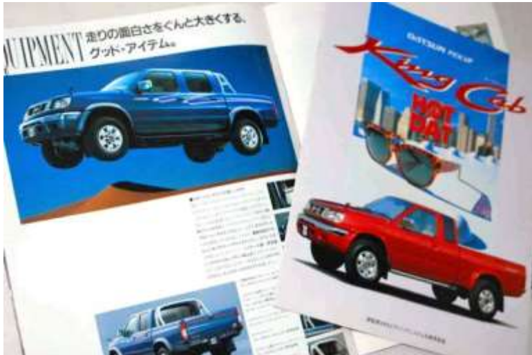
1998 Datsun King Cab

After Nissan phased out the Datsun brand worldwide in 1983, they still continued to use the Datsun name — but only in Japan.