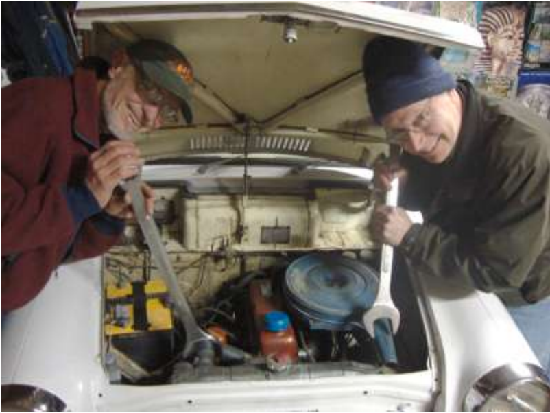
If all else fails get out a bigger wrench!