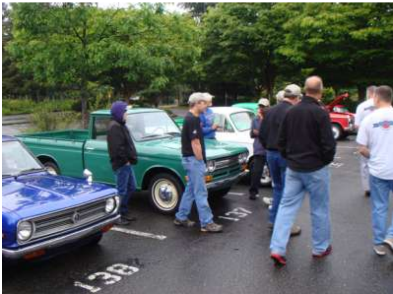
Impromptu Run, Summer 2012

NWDE members meeting for Greenwood Car Show, June 30